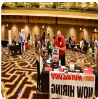
Coastwide Hiring Expo