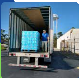
Hurricane Zeta Relief Efforts