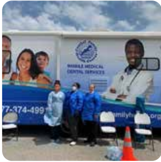
COVID-19 Drive-Thru Testing