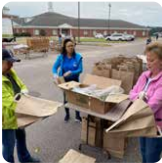
Feeding the Gulf Coast